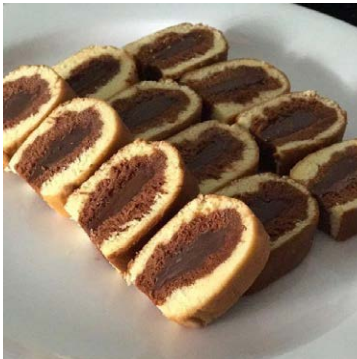
(above) Kuih tapak kuda, cake with nutella filling