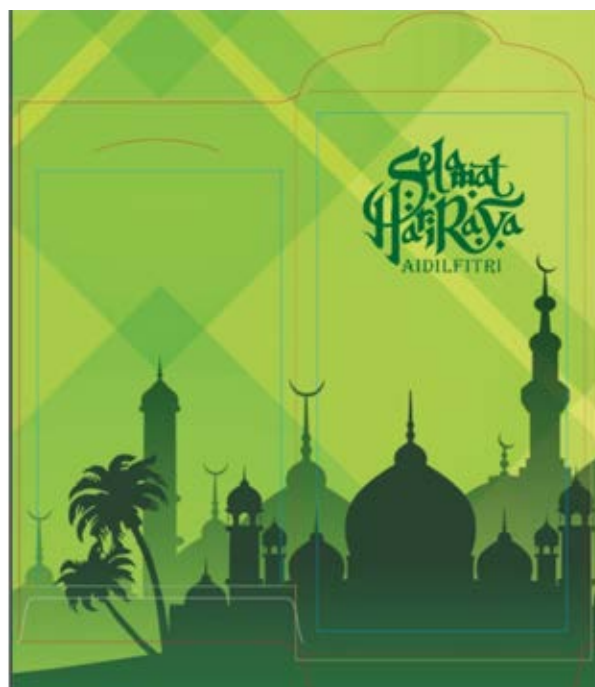
(below) Design for an ang pau, packet containing cash given to children by their elders