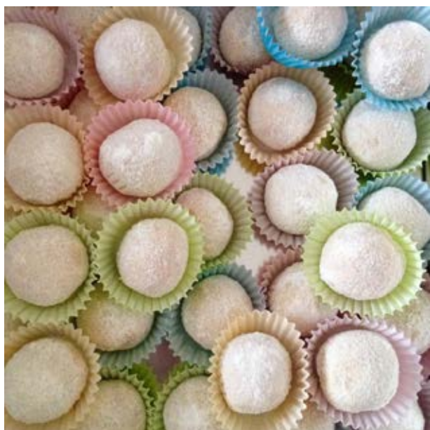
(top left) Kek batik