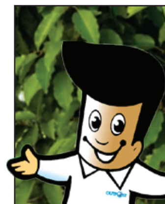
Mr. Outpost Online Promoter