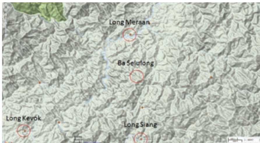
Location of villages visited during the trip.