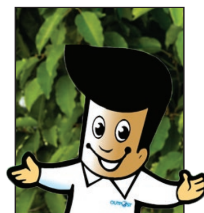
Mr. Outpost Online Promoter