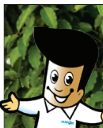
Mr. Outpost Online Promoter