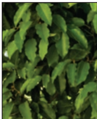
To be announced Focal Point