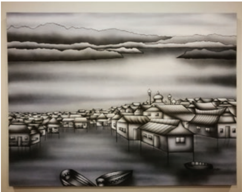
Wall art custom made for the project