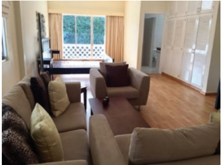
Before photo of the guest room

It was quite a daunting process and due to the limited choice of home furnishings locally, it took longer than expected to put together every piece of the puzzle. That notwithstanding, by end of October we still managed to deliver what is today the New Modern guest room @ 49, at an inaugural ceremony presided over by Ceri.